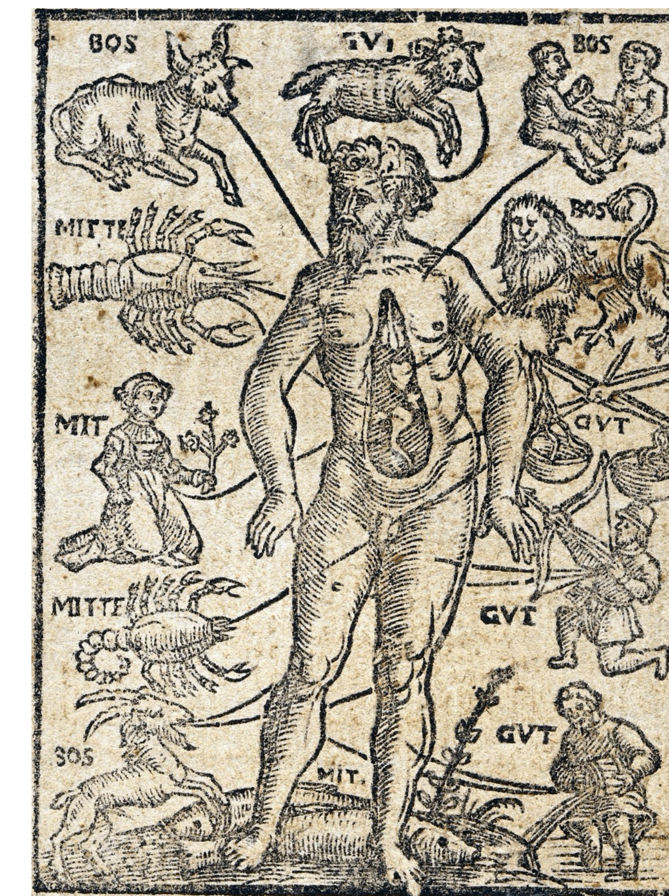
THE MELOTHESIC MAN