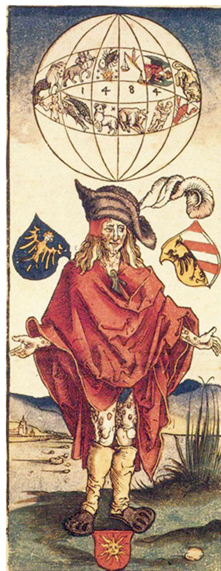
THE SYPHILITIC MAN, DÜRER

CONTACT: helena.avelar@me.com | luisribeiro@me.com