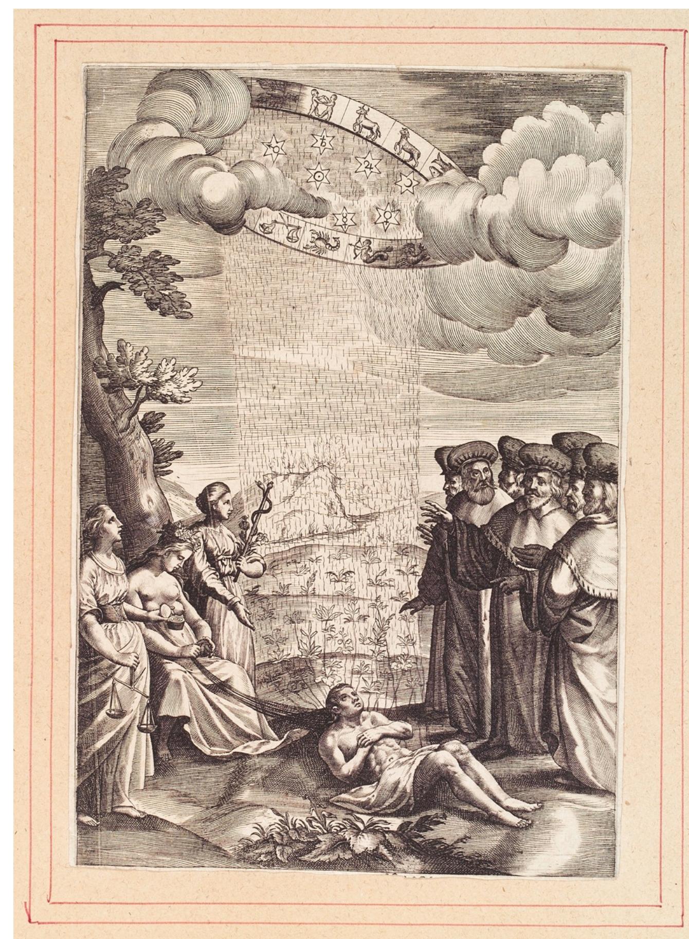
FRENCH (?) IMAGE, 17 TH CENTURY