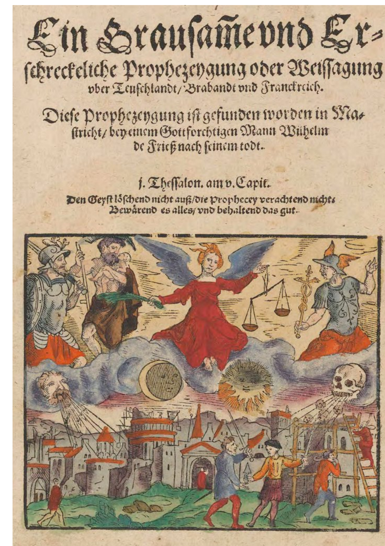
GERMAN IMAGE (?)